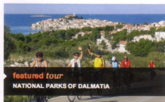
featured tour NATIONAL PARKS OF DALMATIA

2012 dates and pricing are now becoming available for our most popular bike and boat tours! More