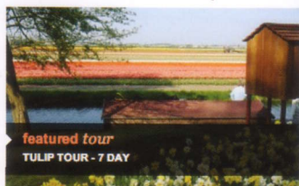
featured tour TULIP TOUR - 7 DAY